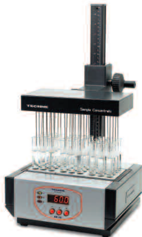
Standard Sample Concentrator (FSC400D).