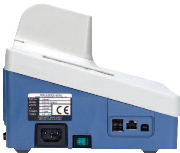
SMP40 Side Profile