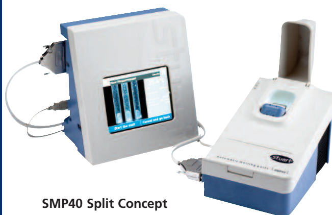
SMP40 Split Concept