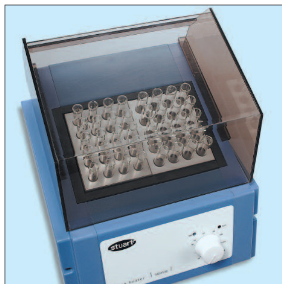
SBH130 with SBH/2